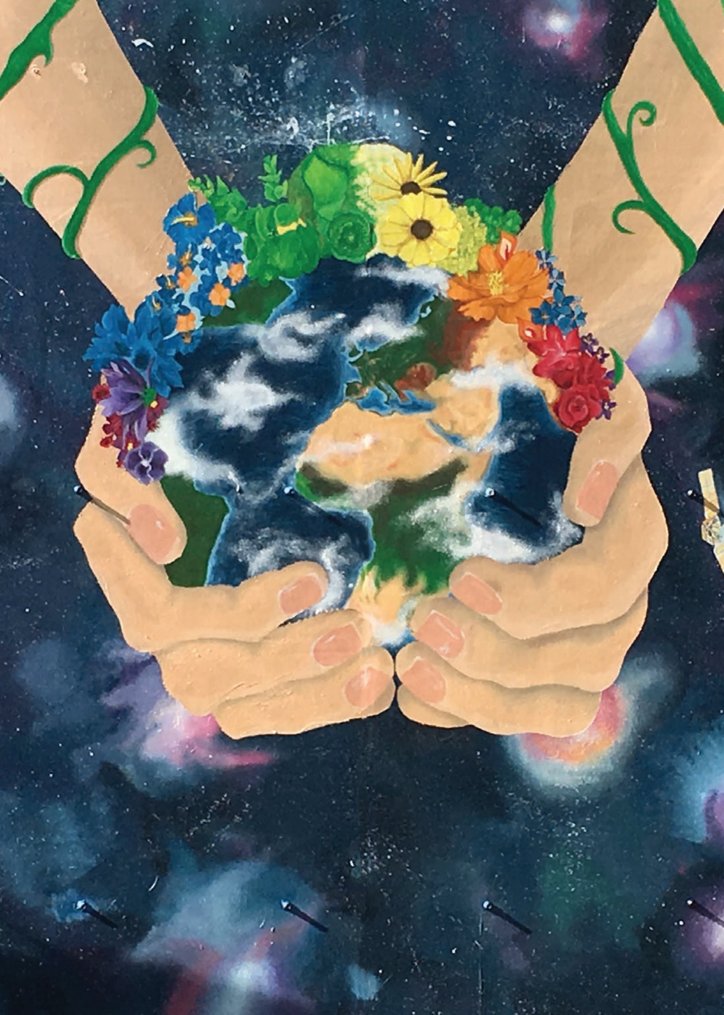
Summer mural projects sponsored by the Embrey Family Foundation

413 9TH STREET • GLENWOOD SPRINGS, COLORADO 81601 WWW. YOUTHZONE.COM • 970.945.9300 • INFO@YOUTHZONE.COM