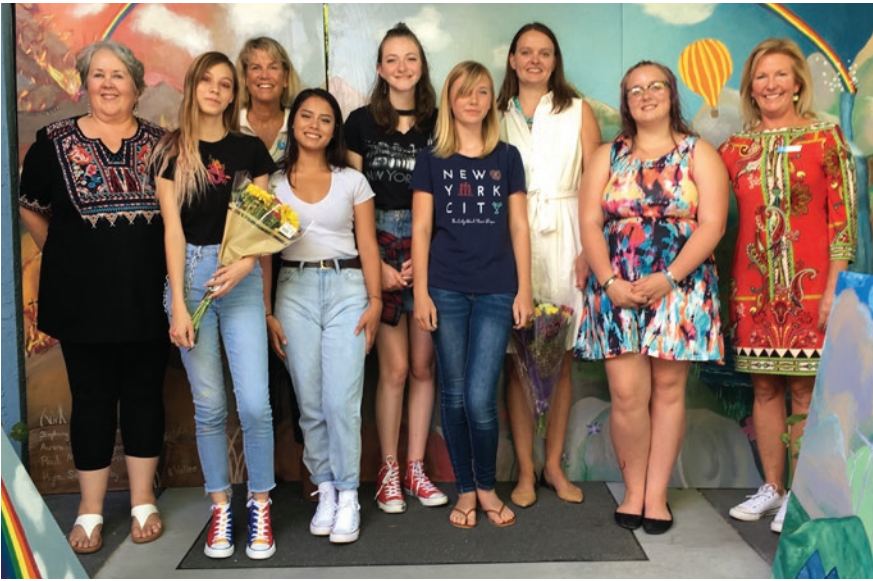
2019 Ascent mural team sponsored by the Embrey Family Foundation.